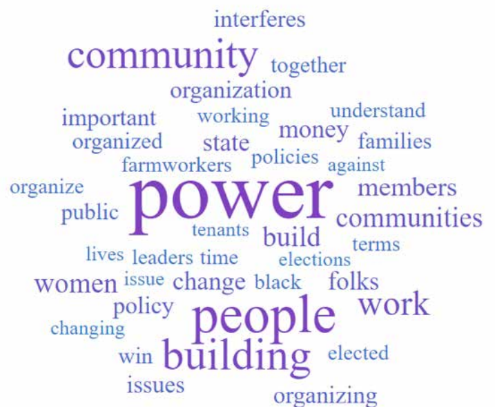
Figure 2. Word cloud based on interview excerpts on definitions of community power

A guiding principle of community power building is that community members are themselves experts about their own experiences and conditions, and as such, they should drive the design, implementation, and protection of policies and reforms that improve their day-to-day lives. And community-driven policy campaigns, in fact, can change lives: paid sick leave in Minneapolis; publicly-funded, long-term care in Washington State; defeating the ability of police to impound undocumented residents’ cars in Santa Ana; building a public transit system in Clayton County outside of Atlanta; and creating a housing trust fund in Detroit.