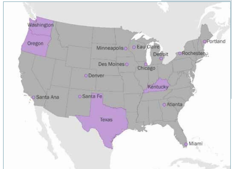
Figure 4. Map of Lead Local Places of Study

As described in the methodology, the Lead Local project team designed criteria for place selection to ensure diverse representation by geographic region, political context, and demography so that lessons from this project could be applicable and scale-able in a variety of contexts. As Table 1 shows, the 16 Lead Local Places represent a diverse array of cities and states in terms of size, race/ethnicity, immigration status, and income. The smallest city is Portland, Maine, with just over 65,000 residents, and the largest city is Chicago, with over 2.7 million residents. States range from Oregon, with nearly 4.1 million residents, to Texas, with nearly 28 million (accounting for close to 9 percent of the entire U.S. population).