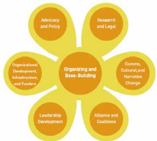
Figure 3. Ecosystem of Power-Building Organizations with Organizing and Base Building at the Center

For communities that are underrepresented and historically-excluded from public and private decision-making processes, building power starts with the on-the-ground, one-on-one work of organizing, building a membership base and developing grassroots leaders. Yet organizing and base building alone are insufficient to build the kind of power necessary to achieve health equity. It requires a place-rooted ecosystem of organizations with diverse capacities, skills, and expertise.