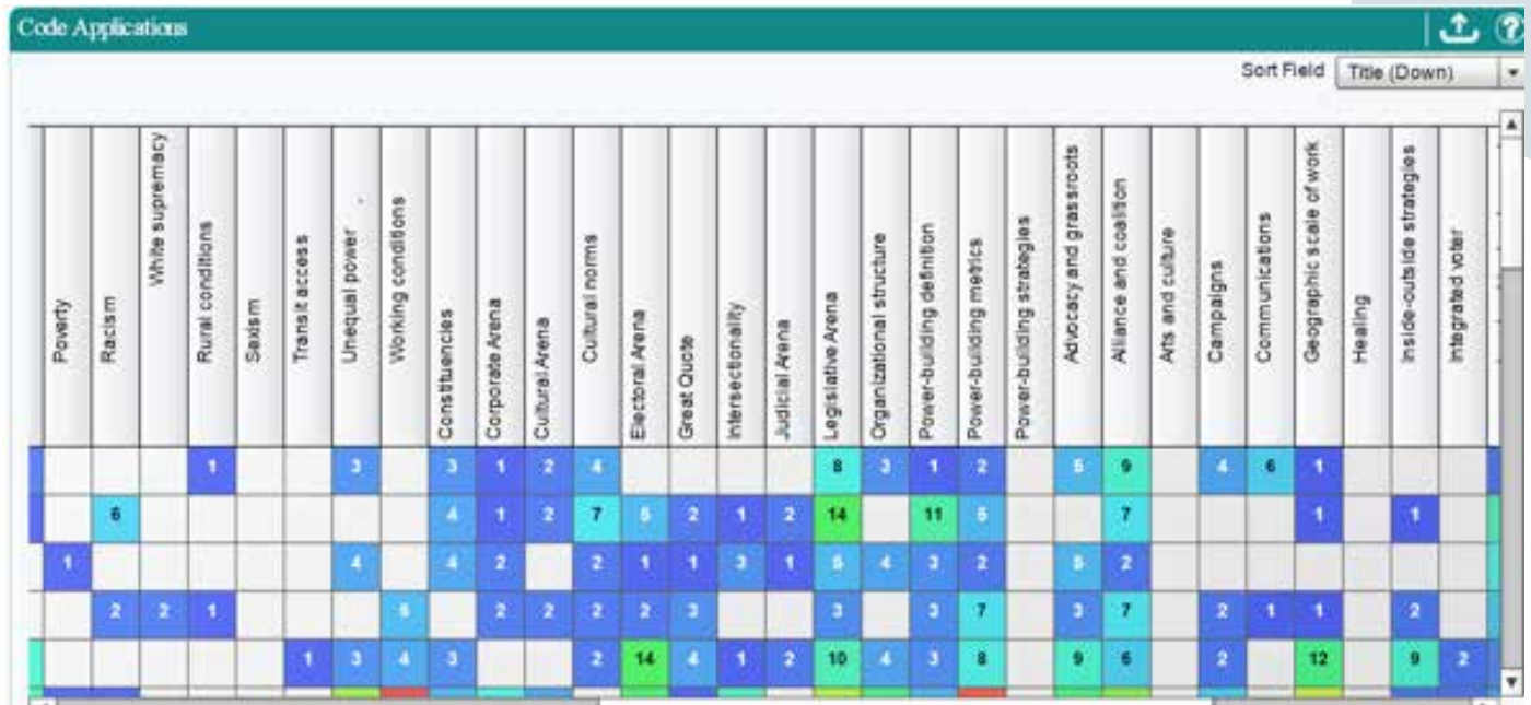
Figure 1. Screenshot of Dedoose showing the code count by interview transcript

Because our analysis is based primarily on interviews with Lead Local partners, the profiles in this report are not intended to provide a comprehensive analysis of the place. In places where there was only one organization, we conducted supplementary interviews. Instead, these profiles are intended to illustrate the specific questions of the Lead Local project and inform future exploration and inquiry.